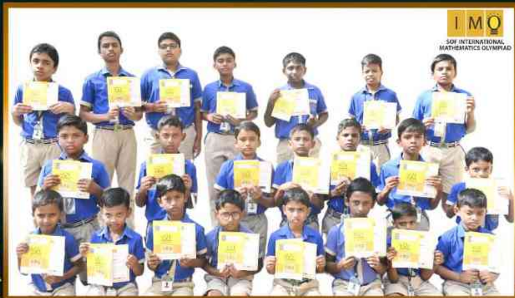
International Mathematics Olympiad Participants (boys)