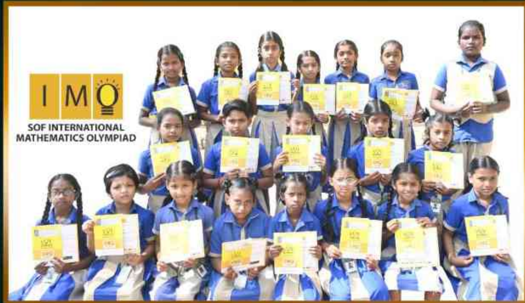
International Mathematics Olympiad Participants (girls)