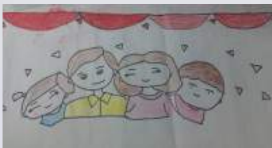
RUDHRASHENE V STD