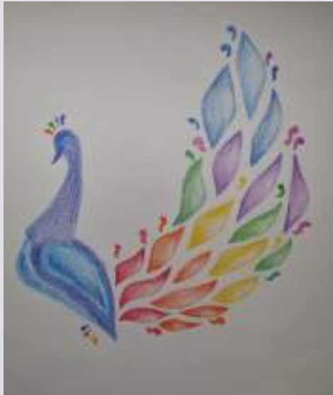
Kamaleshwaran IX STD