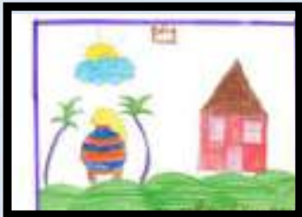
Akshitha V - A1