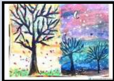
Hemavarshini II - A1