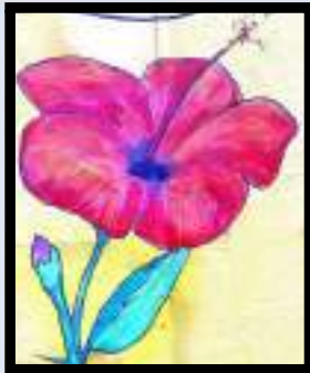
Caleb Balraj VI - A2