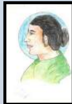
Sharvesh VIII - A1