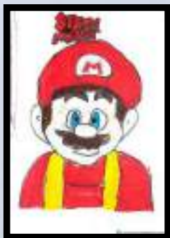
SARAVANAN IV - A2