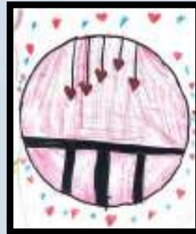
Ashwathika IV - A1