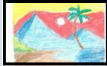
Lakshmanan IV - A2