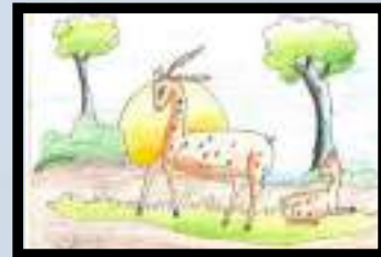
Sharvesh VIII - A1