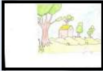
Mounika III - a2