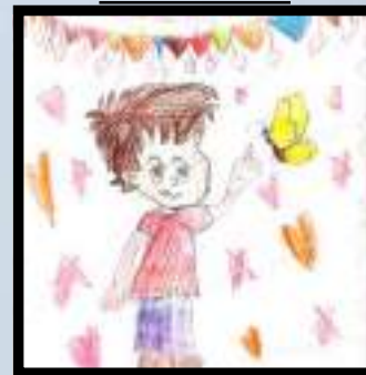
Adwita IV - A1