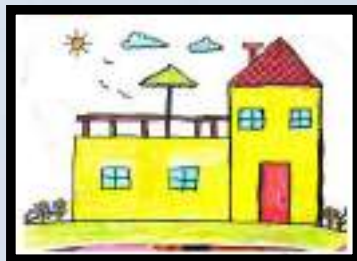
Aarushi Prasath II - A1